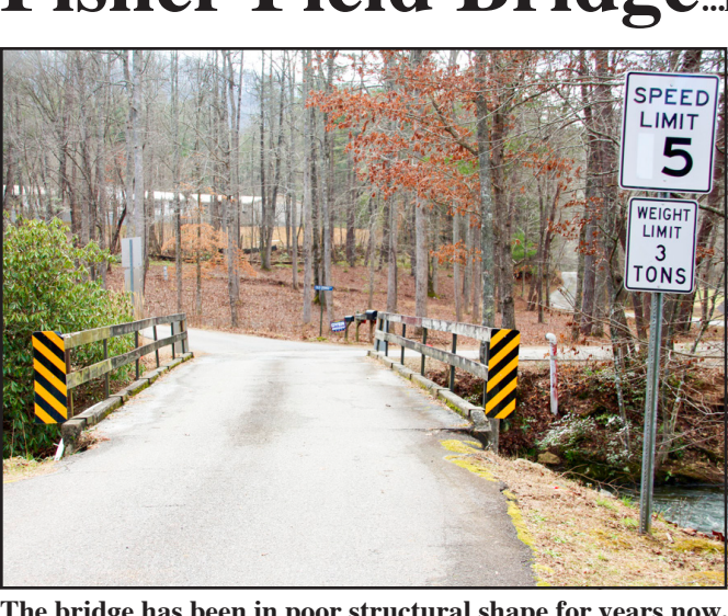
The bridge has been in poor structural shape for years now, with replacement coming after the state put the county on uninterrupted when needed: