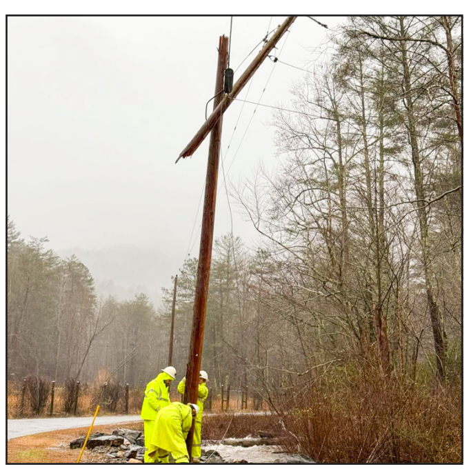
Blue Ridge Mountain EMC linemen were able to get power up and running within 24 hours for customers who lost electricity due to the storm early last week.

Initially, the School System was planning to operate with a two-hour delay on Tuesday, Jan. 9. But after reports of downed trees and power outages early Tuesday morning, the system decided